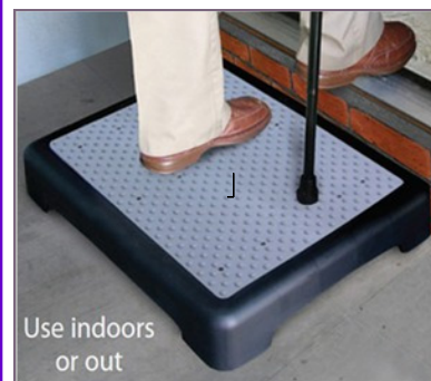
Use indoors or out

Reduce the effort of navigating stairs by placing this wide, sturdy platform outside any doorway. The Outdoor Riser Step allows